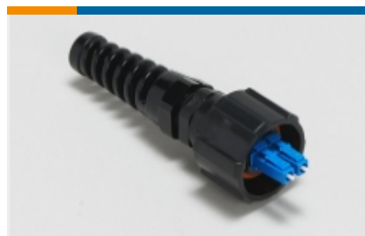
ODVA LC Connectors(3)